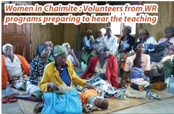
Women in Chaimite; Volunteers from WR programs preparing to hear the teaching

church leaders. The Chapel has set up water systems in two villages that make it possible for people to get water close to home. In the past they walked 2-4 km with heavy containers on their heads and some were killed by crocodiles at the river.